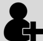
BOARD MEMBER 2