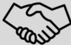
TECHNICIAN BRANCH REP