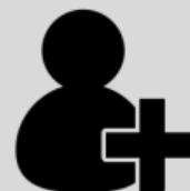
BOARD MEMBER 1