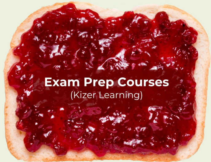
Exam Prep Courses (Kizer Learning)

The AALAS Learning Library provides training that is essential for technicians, veterinarians, managers, IACUC members, and investigators working with animals in a research or education setting.