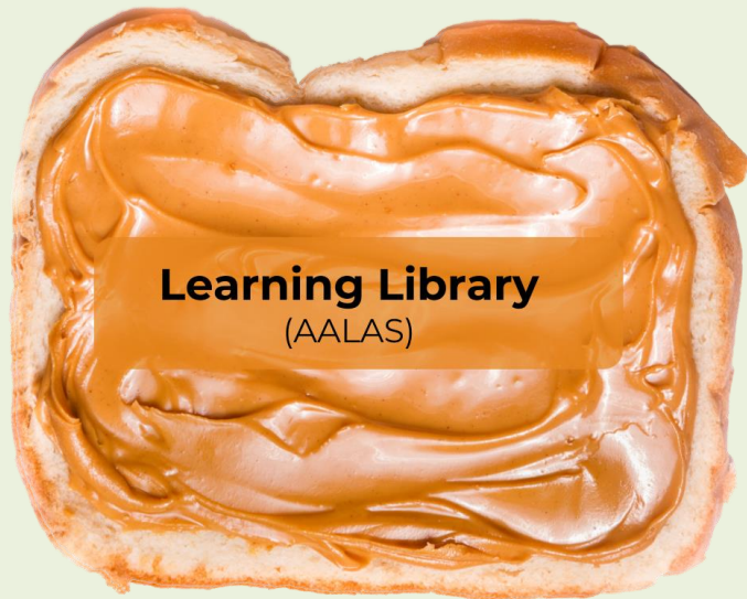
Learning Library (AALAS)

Washington Branch AALAS offers members access to TWO learning portals!