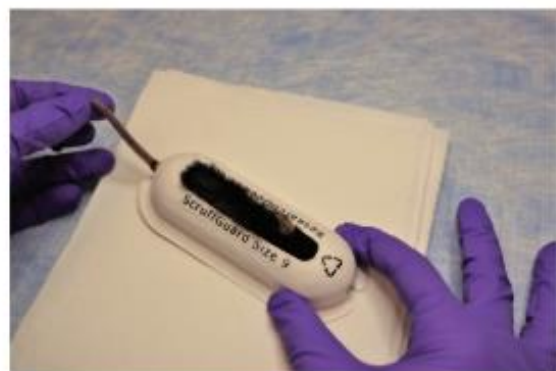
Figure 3. Animal on a soft surface with the ScruffGuard placed over top.