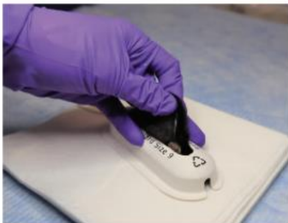
Figure 4. Loose skin gently, but firmly held through the slit of the ScruffGuard.