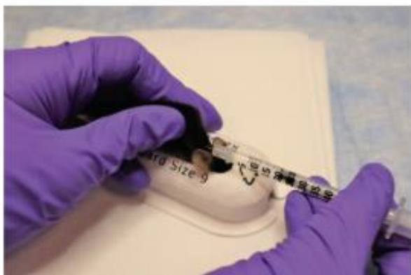
Figure 5. Mouse being restrained for a SC injection using a ScruffGuard.