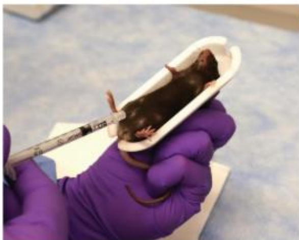
Figure 6. Mouse being restrained for an IP injection using a ScruffGuard.

safety, it is essential to make sure you're using the correct size based on the animal's weight – too small and the animal could be harmed by the downward force applied, too large and the animal may fit its head through the top slit and have access to the handler. To get started, place a short stack of vivarium-grade paper towels or a disposable sponge (about ½ inch thick) on the tabletop to create a soft surface under the mouse where pressure can be gently applied (Figure 2). Next, place the animal on the towels or sponge in the direction you want them to face. Swiftly cover the mouse with the scruffing restraint device so only the tail extrudes on one end and ensure all feet are tucked in (Figure 3). Gently lift the loose skin through the slit at the top of the device and hold firmly between two fingers (Figure 4). Depending on the task, you could keep the mouse on the surface (Figure 5) or lift to expose the ventral side (Figure 6). Once complete, release your hold of the loose skin and lift the device while maintaining a grip on the mouse's tail.