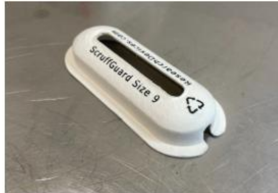
Figure 1. Disposable ScruffGuard, size 9.

Using a scruffing restraint device is very simple and easy. A device like the ScruffGuard comes in several sizes and can be used with mice up to 48g. 2 For everyone's