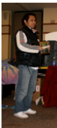
2009 Technician of the Year Colt

This year's Trade Fair was another fun event. Almost 100 members were in attendance and 15 vendors had tables set up to display their wares and meet with customers. The morning started out with coffee, fruit and pastries and time to mingle with everyone. The talks started at 9:00 and ran until lunchtime, with a break mid-morning for refreshments and more "shopping" at the vendor tables.